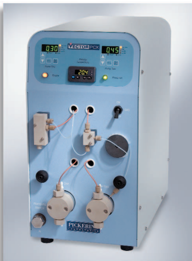
Vector PCX provides easy access to fluidics and simple operation.

A relief valve pre-calibrated to open at 35 bar (500 psi) prevents rupture of the post-column reactor tubing in the event of downstream blockage, and reduces the possibility that all or part of the reagent flow will be diverted to the column